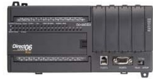
D0-06DD2 DC in/DC out/AC supply