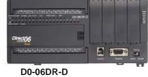
D0-06DR-D DC in/Relay out/DC supply