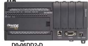
D0-06DD2-D DC in/DC out/DC supply