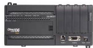
D0-06DD1 DC in/DC out/AC supply