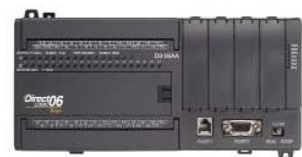
D0-06AA AC in/AC out/AC supply