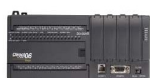
D0-06AR AC in/Relay out/AC supply