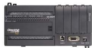
D0-06DR DC in/Relay out/AC supply