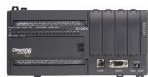
D0-06DA DC in/AC out/AC supply