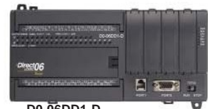
D0-06DD1-D DC in/DC out/DC supply